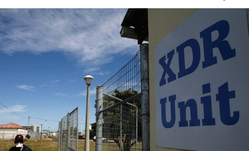
Resistance measures: People with extensively drug-resistant TB have defied quarantines